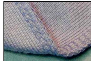
514 Stitch – ISO4915

This 2 1/2 hour Stitchology workshop is loaded with practical, helpful ideas that can assist you in resolving everyday sewing issues. You will draw upon information covered in our Threaducation workshop, a prerequisite for Stitchology . You are encouraged to bring sample garments with thread and seam related quality issues to the class for discussion.